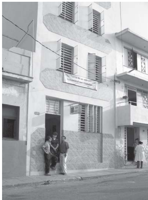
The newly reconstructed Bahá'í center in the heart of Havana.