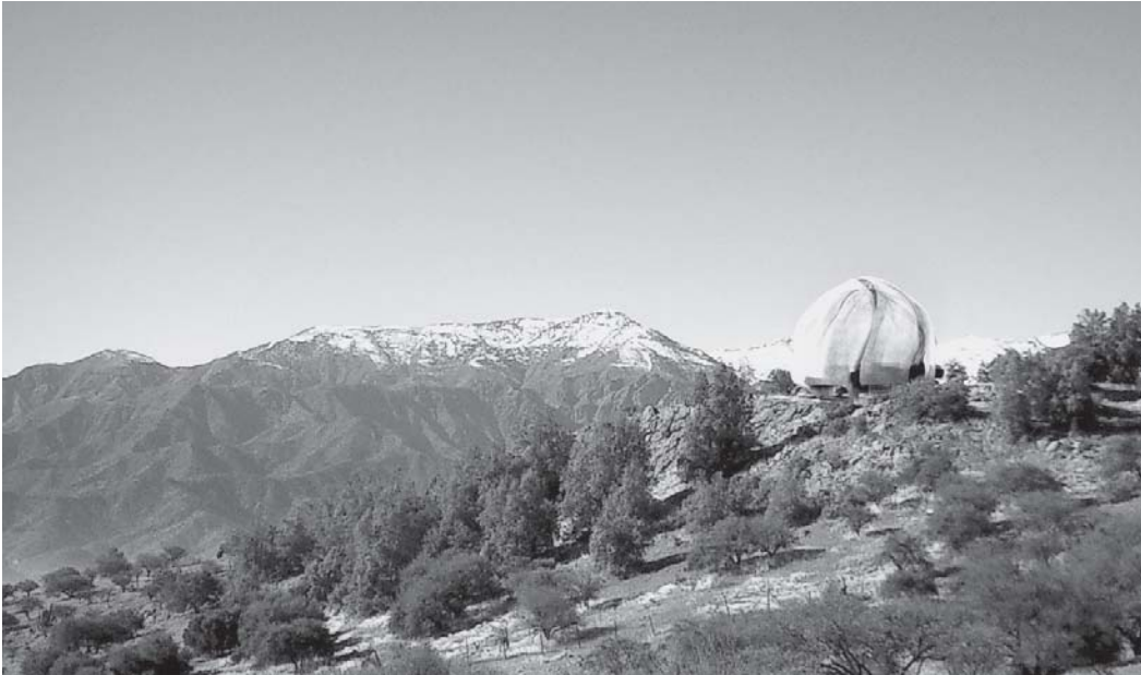
A model of the Bahá'í House of Worship for South America superimposed on a photograph of its planned site north of Santiago, Chile.

SANTIAGO, Chile — Though ground has not been broken and its projected completion is still three years away, the Bahá'í House of Worship planned for this city has already drawn accolades from more than 40 international architectural and design journals from as far as Italy, Germany, Australia, and Russia.