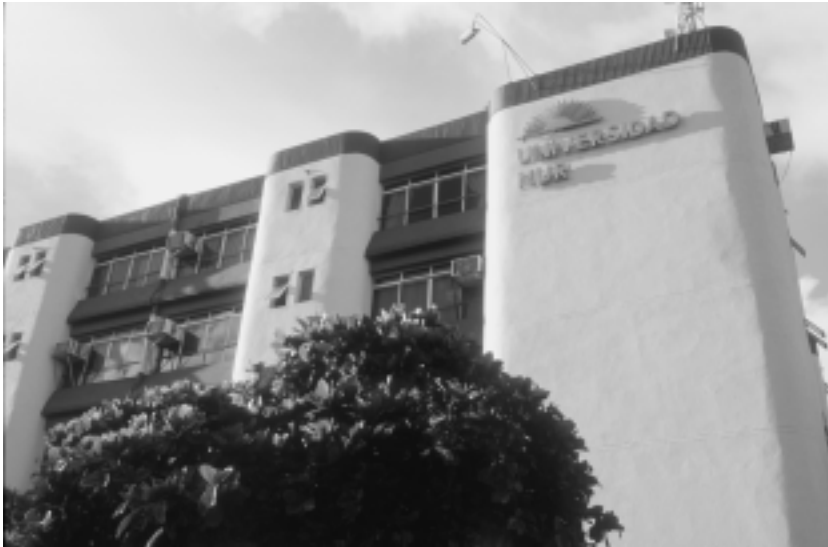
The main building of Nur University in Santa Cruz, Bolivia. The moral leadership training framework is incorporated into the University's curriculum and, through various projects, is a major outreach program.

“All of the problems that have been generated by traditional leadership styles —by authoritarian, paternal, manipulative and know-it-all styles —are ineffective because they are not based on noble human values but instead are based on the egocentric and self-serving pursuit of power.