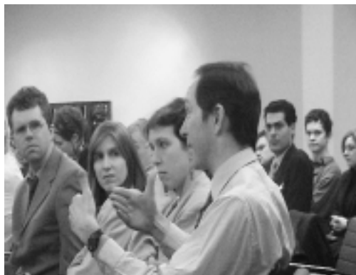
There was active participation from the audience at the Science of Morality conference.

“The late emergence of sociopathic profiles in children who have suffered early bi-