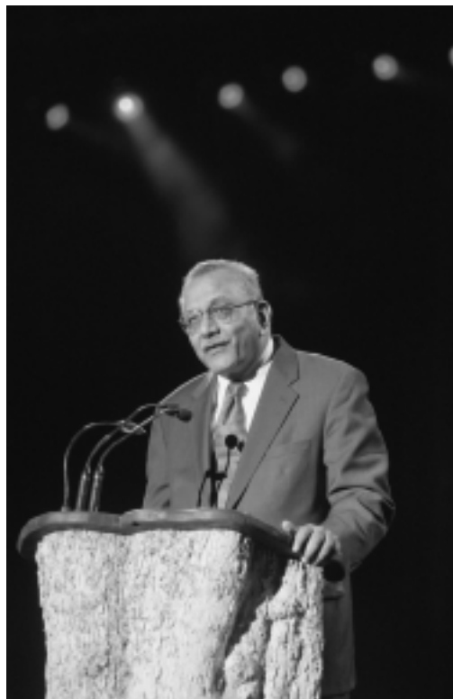
WSSD Secretary-General Nitin Desai at the Summit's opening ceremony on 25 August 2002.

– Thabo Mbeki, President of South Africa