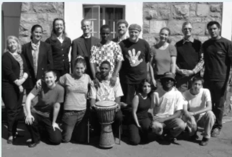
More than 30 representatives of six Bahá'í and Bahá'í-inspired organizations were accredited to the Johannesburg Summit. Some posed here for a group photograph.