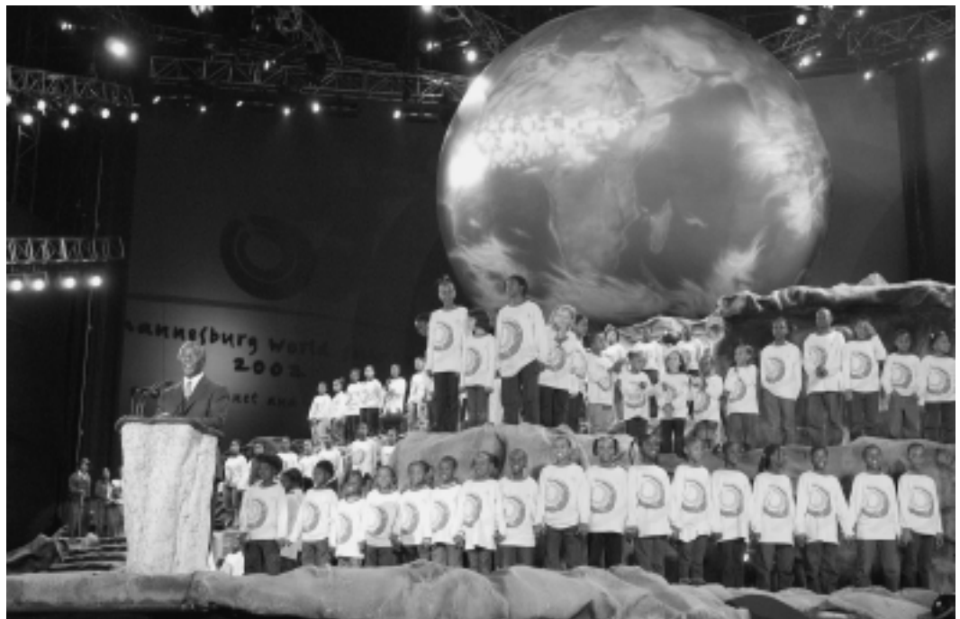
South African President Thabo Mbeki welcomes delegates to the World Summit on Sustainable Development at the Ubuntu Village on 25 August 2002.