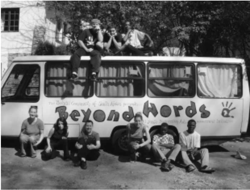
"Beyond Words," a performing arts troupe composed of Bahá'í youth from Albania, Cameroon, Canada, the Czech Republic, Ecuador, South Africa, the United Kingdom, and the United States, gave several performances at various venues at the World Summit on Sustainable Development.

"One of the things that happened at Johannesburg was the rift between the North and the South has been turned around a little bit. I think after the Johannesburg outcome, cooperation is going to be easier."