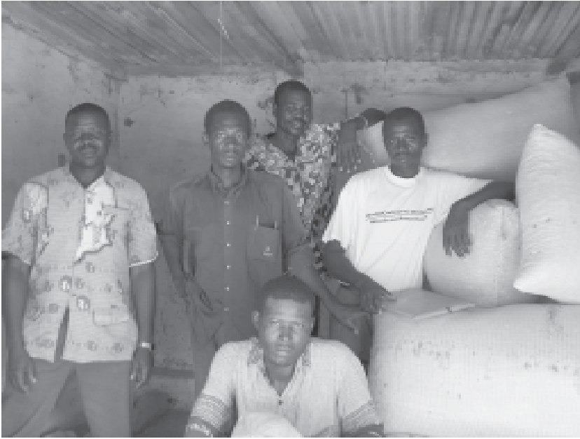
In the village of Waltama, the men's group has organized a village granary, which enables villagers to store grain until the market price is highest.

their success. The creation of a village granary exemplifies that spirit, said Michel Miramadjingaye, who is president of the Waltama group.