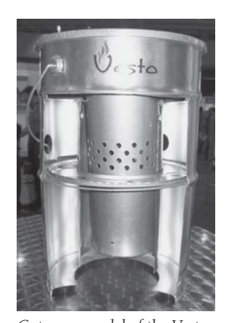
Cutaway model of the Vesto stove shows the various chambers that help to preheat the incoming air, boosting the stove's efficiency.

- Crispin Pemberton-Pigott, New Dawn Engineering