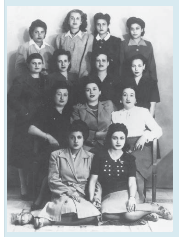
A group of Bahá'í women in Alexandria, Egypt, in 1947.

The Bahá'í community of Egypt grew steadily during the