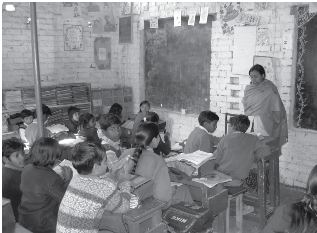
A classroom at the Nine Star School in Dasdoi, Uttar Pradesh, India. It is one of eight village-level private schools that have been started since 2001 by a group of young Bahá'ís working under the guidance of Foundation for the Advancement of Science (FAS), a Bahá'í-inspired NGO located in Lucknow, Uttar Pradesh.

A pilot project seeks to train and support educated rural youth in the processes and profession of primary education, with the goal of starting small, sustainable and effective private rural schools.