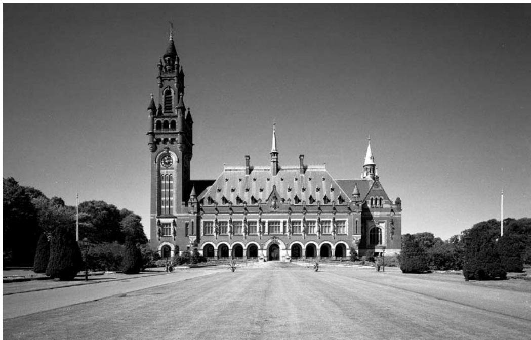
The Peace Palace in The Hague was the venue for the signing of the Faith in Human Rights statement.

Hague Conference , continued from page one freedom of religion or belief, the principle of equality and the prohibition of torture.