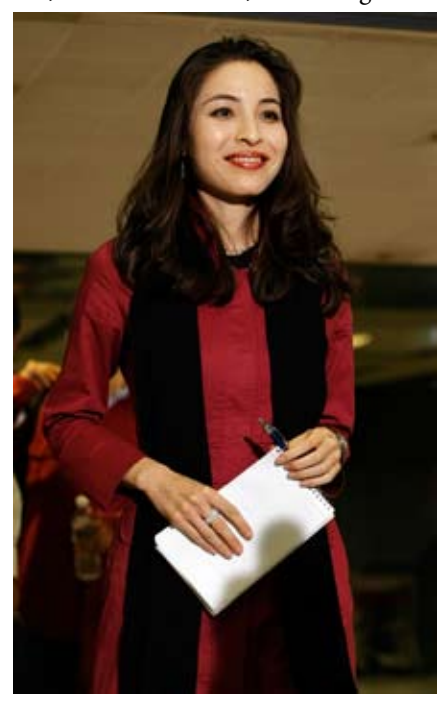
Roxana Saberi at a news conference in May 2009 after her return to the United States.

Ms. Saberi's description of the conditions facing the two Bahá'í women offers considerable insight into what it is like to be unjustly incarcerated in Iran today — a situation experienced not only by Bahá'ís, but by hundreds if not thousands among the journalists, women's activists, human rights