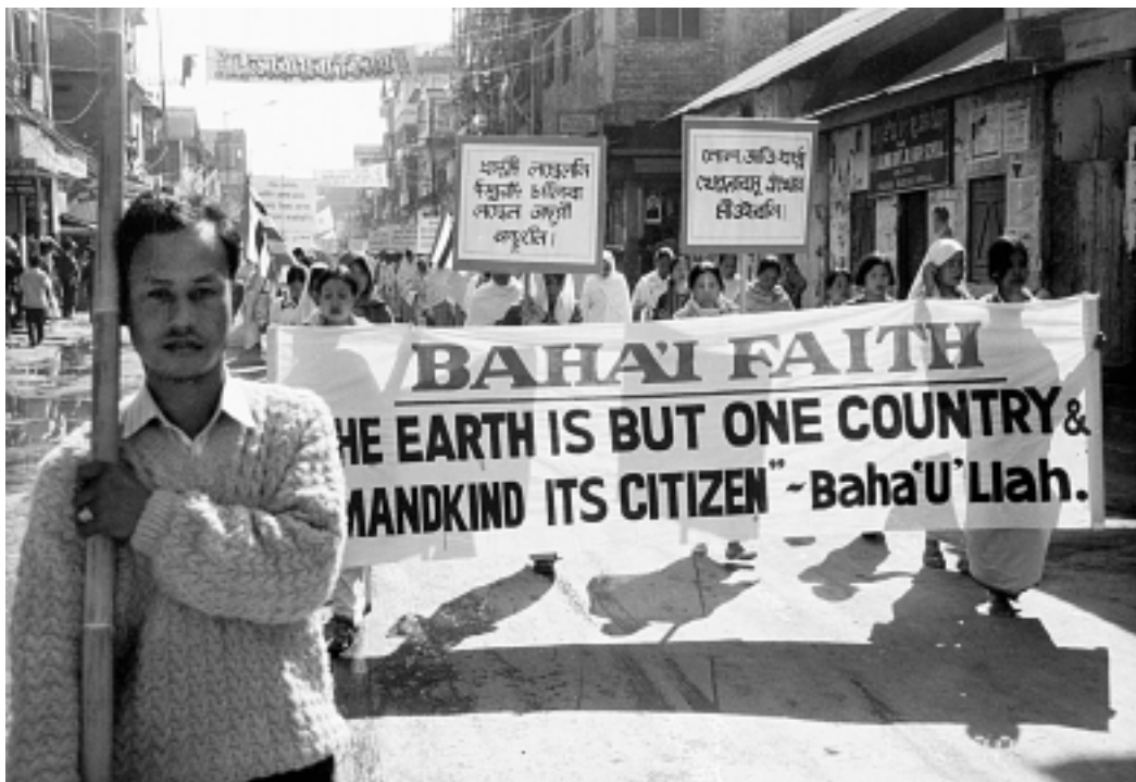
In India, Bahá'ís have long promoted intercommunal harmony.

around them, using a wide range of non-violent and peaceful means. These activities include work with the United Nations and its agencies, with governments and like-minded non-governmental organizations and religious groups; educational initiatives; media-based outreach campaigns; grassroots initiatives; youth workshops; and individual initiatives that encompass a variety of innovative and creative approaches to local problems and concerns.