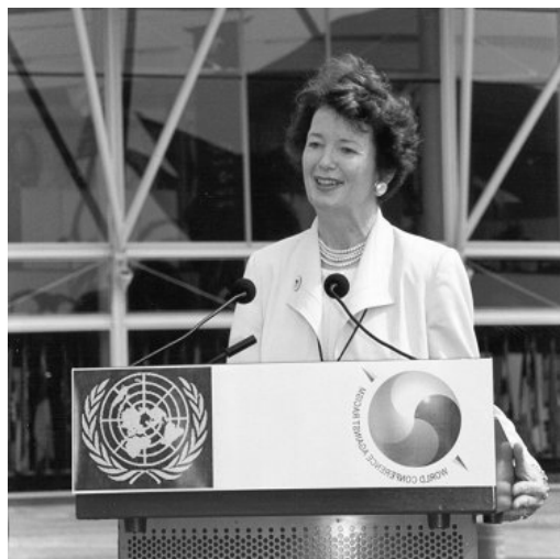
Mary Robinson, UN High Commissioner for Human Rights, acted as Secretary General of the World Conference against Human Rights, held 31 August–8 September 2001 in Durban, South Africa.

Some human rights specialists said that the language on the issue of slavery and its legacy