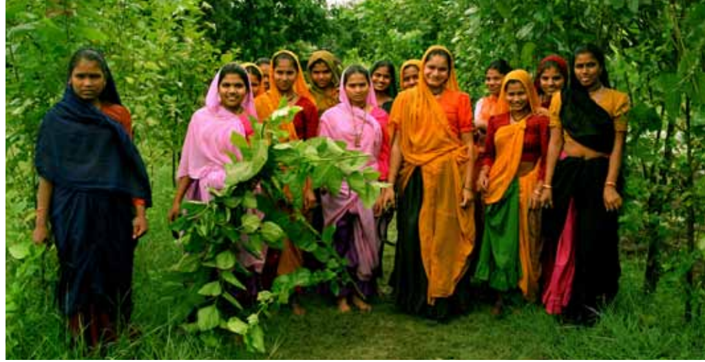
Agriculture is an important subject at the Barli Development Institute for Rural Women in Indore, India.

• Systematic learning and participation. The concept of participation also emerges in a new light. Effective participation requires a systematic process of learning within each community, in a way that enables the community to identify its strengths and its needs; to experiment with new ideas and methods, new technologies and processes; and ultimately, become the primary agents of their development. One of the first steps in establishing participatory development is to promote the engagement of an increasing number of individuals in processes of learning—characterized