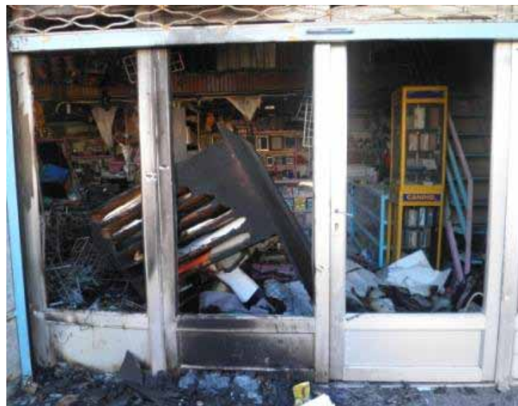
Above: A Bahá'í-owned shop in Rafsanjan, Iran, targeted by arsonists.

The attackers have targeted household furniture repair businesses, home appliance, and optical stores, in particular.